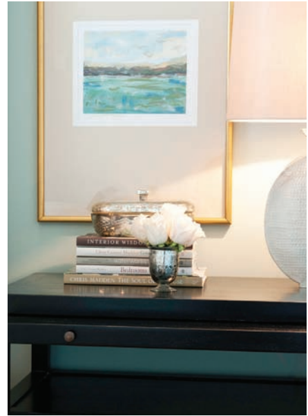
Furniture and Accessories (The French Basket); Paintings by Lisa Wallace